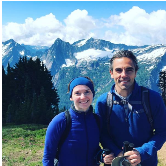
My husband and me at the summit of Mt. Dickerman in the Mount Baker-Snoqualmie National Forest