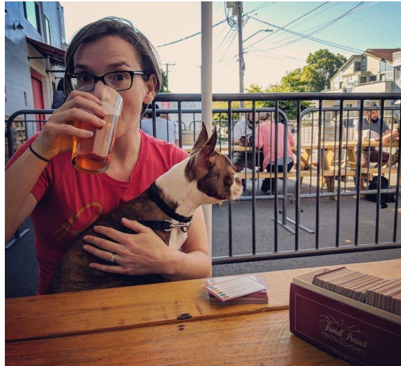
Enjoying a few of my favorite things: dogs, craft beer, and trivia at Lucky Envelope Brewing in Seattle

I'm grateful for our Apra-NW community, and I hope you are, too. I encourage you to make the most of your membership: participate, make use of our resources, ask questions, volunteer, and share your knowledge and experience! I look forward to connecting with more of you over the next year, and hope to see you in Seattle at our spring conference in May 2019!